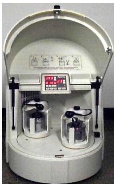
Figure 1. Planetary ball mill (classic line Fritsch Pulverisette 5) with two jars.