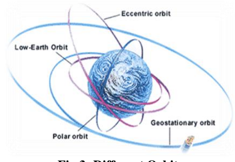
Fig 3: Different Orbits

The main advantage of installing a space power station in geostationary orbit is that the antenna geometry stays constant, and so keeping the antennas lined up is simpler. Another advantage is that nearly continuous power transmission is immediately available as soon as the first space power station is placed in orbit; other space-based power stations have much longer start-up times before they are producing nearly continuous power. A collection of LEO space power stations has been proposed as a precursor to GEO space-based solar power. The idea of the Solar Power Satellite energy system is placing giant satellites, with wide arrays of solar cells embedded on them, 35,780km above the Earth's surface in the geosynchronous orbit.