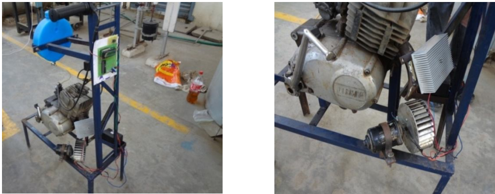
Fig. 1: Experimental setup

The specification of the two stroke petrol engine is shown in the Table 2.