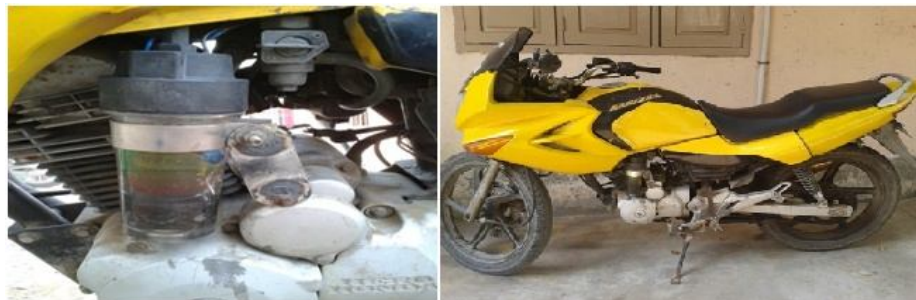
Fig. 1. HHO generator attached with motorcycle.

The overall electrolysis reaction is \text{H}_2\text{O} \rightarrow \frac{1}{2} \text{O}_2 + \text{H}_2 . However, reaction at each electrode differs between the anode and cathode. Hydrogen production is at the Cathode. The reaction is 2 \text{H}^+ + 2\text{e}^- \rightarrow \text{H}_2 . Oxygen production is at the Anode. The HHO combines with the petrol and air in the combustion chamber and is burnt. Once burnt, it converts back to the form of \text{H}_2\text{O} [water]. It absorbs the inner heat from the engine normally at 350 - 450 0 F and turn into super-heated DRY steam. Then it's pushed out during the exhaust stroke and out the tail pipe. The reaction by combustion is 2\text{H}_2 + \text{O}_2 \rightarrow 2\text{H}_2\text{O} . The Fig. 1 shows the HHO generator attached with the motorcycle in the present study.