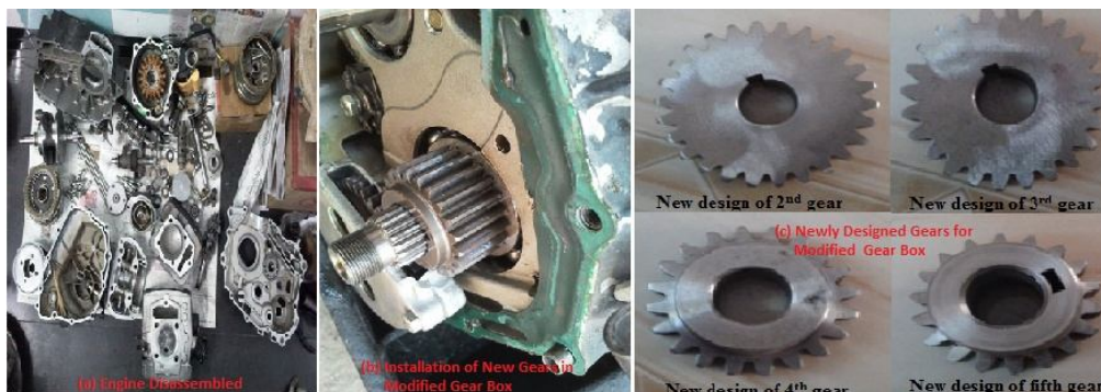
Fig. 2: Engine disassembly and installation of new gears in the modified gear box.