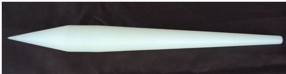
Figure 2: Tapered Nylon dielectric rod antenna ( \theta_0= 2.5^\circ ).