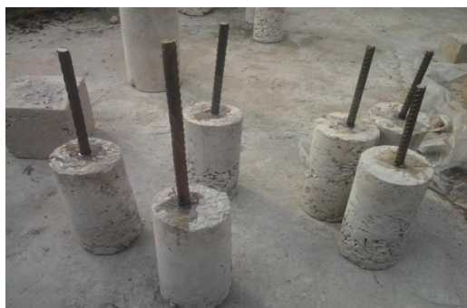
Figure 3b: Reinforcements installed using epoxy-based adhesives as binding agents.

Concrete cylinders were used for this test instead of concrete cubes because the cube size is limited to 150mm and its easier to hold the concrete cylinders in the test machine than to hold cubes for the pull-out test. A universal testing machine was used to perform the pull out tests on the post-installed reinforcements in concrete cylinders. The results of the test were obtained as a printout from the digital display component of the machine. The test was carried out in accordance with the provisions of BS 1881 Part 116:1983 [29]. The bond strength was calculated for each type of adhesive material and embedded length, the values obtained were compared with the minimum standard specifications in Table C1.2 of European Technical Approval manual for good bonding conditions for diamond drilling method (wet cutting system) [30].