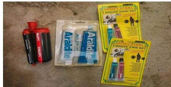
Figure 1: Types of Adhesive used: HIT 500, Araldite and 4 minutes

were used to glue the anchors to the concrete. The first one is called HIT RE 500 (Adhesive TYPE I) which is an epoxy-based adhesive with a high strength specifically designed to fasten in solid based materials. The second is Araldite (adhesive TYPE II), a slow curing adhesive that has a wide range of application including sealing up ceramics, metals etc. The third is Four minutes (adhesive TYPE III), a rapid curing adhesive that has a wide range of application including sealing up ceramics, metals etc. These three types of adhesives used as shown in Figure 1 were selected based on availability in Nigeria. Two different ribbed bar diameters of 12 mm and 16 mm were used in this study and were of tensile strengths of 383N/mm 2 and 390N/mm 2 respectively.