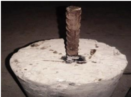
Figure 9a: Pull through failure mode

The results of the pullout test performed on each type of adhesives at two different embedded length for the two bar sizes selected are as presented in Figure 3. No cone failure was observed in any of the pull-out tests conducted on 4minutes and few cone failure were noticed in Hilti and Araldite at a lower embedded depth of 10d. Pull through failure mode was noticed in all the 4minutes samples tested without any crack observed on the concrete (Figure 9a) while the adhesive/concrete interface failures were noticed in the Hilti and Araldite at a high embedded length of 15d (Figure 9b). The most commonly observed is the adhesive/concrete interface failures which were as a result of a stronger bond between the adhesives and bar, this was also common with higher embedded lengths. The bar/coating surface failure was predominant when Araldite was used, this was as a result the presence of more bonding strength between the concrete and the adhesives than it was between the adhesive and the bar.