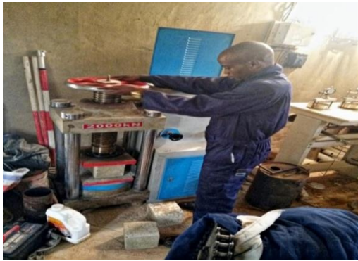
Fig. 2: Compressive strength test machine

machine conforming to EN 12390-4:2000 specifications (Figure 2)[28]. The maximum load sustained by the specimen was recorded and the average compressive strength of the concrete was calculated for each of the curing days.