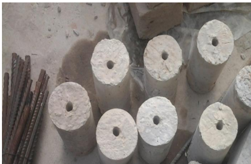
Figure 3a: Holes drilled in concrete cylinders

The pull-out test was carried out on post-installed reinforcements in concrete cylinders at 28 days of curing. The depths of embedment of the reinforcements were varied in multiples of the bar diameters i.e. 10d and 15d. Two different bar sizes; 12mm and 16mm were used for post-installed reinforcement. The diameter of holes drilled at the centres of the concrete cylinders (Figure 3a and 3b) were 4mm greater than the bar sizes installed.