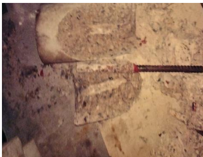
Figure 9b: Adhesive/concrete interface