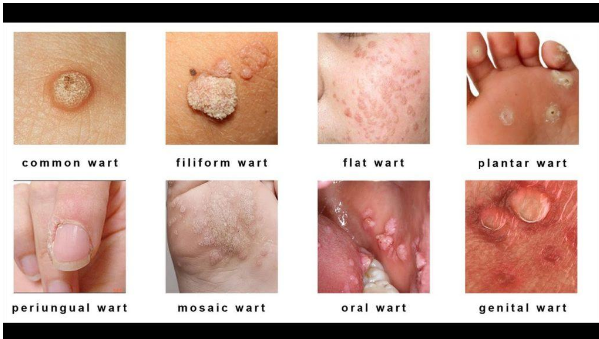
Fig. 2: Types of Warts

The main goal of this work is to present Methodology based on rough set theory and hypergraph for generating classification to predict the response of wart treatment. The data set is taken from the UCI machine learning repository [30, 31]. This dataset contains information about wart treatment results of 90 patients using immunotherapy. We