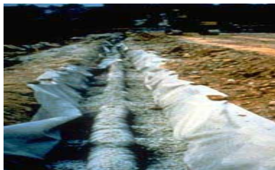
Figure 1: Geo-textile used for drainage.

Elongation, abrasion resistance, clogging length and flow etc