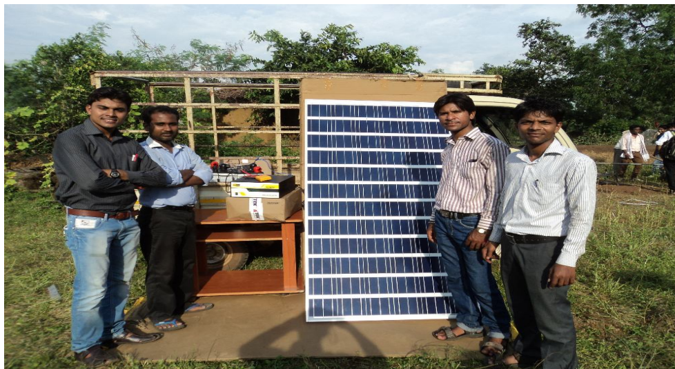
Fig. 2: Hybrid power system(solar power and human power).

Before starting the experiment the alternator was connected with battery and ampere meter was jointed in series. The mechanical link GI pipe was fitted with the first shaft of speed increaser by means of elbow and nut-bolt at one end and another end was coupled on belan with the help of GI wire such that the center of belan coincide at 2500mm of mechanical link. The speed increaser was fixed in the pit of 780mm×780mm×300mm. The human started moving into the circular path and also the belan along with mechanical link rotate the first shaft of the speed increaser. At the starting the rpm was very low hence the alternator was not responding but as well as speed was increasing the alternator start to generating power. The rpm and generated volt & current were taken after every four minutes. The batteries were 50% charged and it took approximate 2 hours to charge fully (multimeter indicate 12.6V).