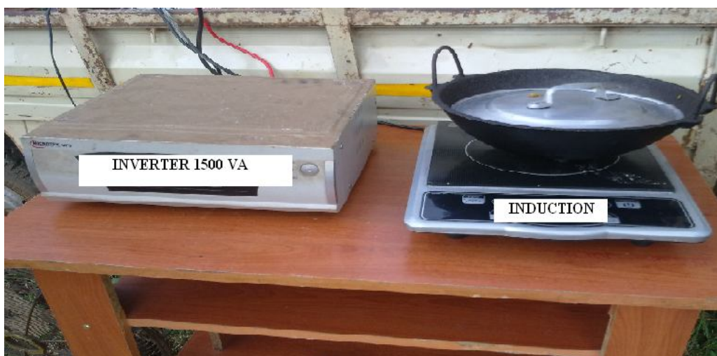
Fig. 4: Induction cooker of 1000W subjected to hybrid power system.

Finally charged tubular batteries by solar power and human power were connected in series individually after then connected parallel to the inverter and delivered power to 800W load for 6 hrs (average). Experiment also done during charging batteries by human power and solar power and results found that when induction cooker working at 800W it took 25 minutes (ave) to rice and 35 minutes (ave) to cook vegetable four people. Hence solar power and human power are good combination for home cooking system.