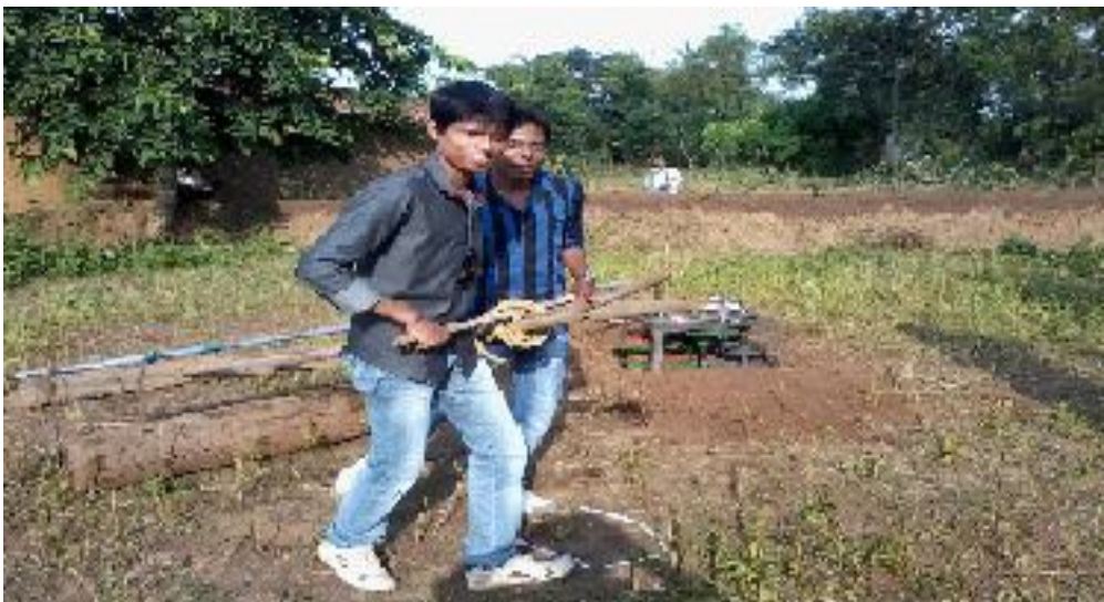
Fig. 1: Human powered mechanical device.

The fabrication of speed increaser was done very carefully because there are five vertical shafts which are supported by taper roller bearing. The bearing covers were fitted with the help of nut and bolt on the mild steel ties, which are welded on the frame at top and bottom. Collars are provided at bottoms of shaft to support the load on bearings. Gears are fitted by means of nuts by drilling two holes on the shafts and on gear hubs. There are four step gear transmission system. The first gear of 68 teeth was mounted on first shaft at 20mm from the collar which meshes with the second gear having 15 teeth mounted on second shaft at 20mm above from the collar. The third having 68 teeth was mounted on second shaft 50mm above the second gear and meshes with the fourth gear having 15 teeth which was mounted on third shaft at the same height. The fifth gear having 68 teeth was monthed on third shaft 50mm above the fourth gear and meshes with the sixth gear having 15 teeth which was mounted on the fourth shaft at the same height. The seventh gear having 68 teeth was mounted on fourth shaft 50mm above the sixth gear and meshes with the eighth gear having 15 teeth which was mounted on fifth shaft at same height. The pulley of 228.6mm (9 inch) was mounted on fifth shaft at 200mm from the bottom which drive the another pulley of 76.2mm(3 inch) mounted on alternator and alternator was fabricated on the frame with the help of mechanical linkage.