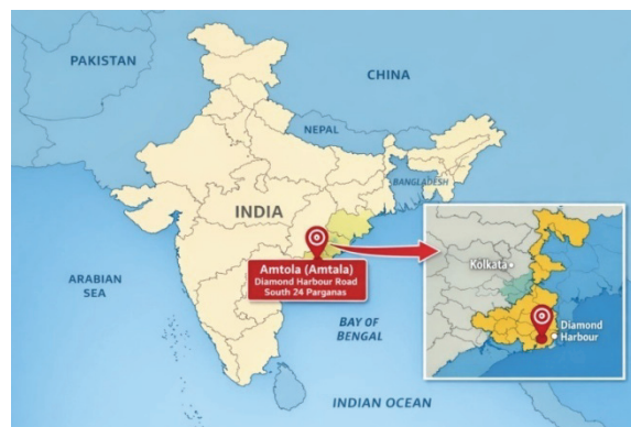
Figure 1: (Amtola, Diamond Harbour Road), South 24 Parganas, West Bengal, India.

The study area, Amtola, is located along Diamond Harbour Road in South 24 Parganas district, West Bengal. The absolute location of South 24 Parganas is from 22^{\circ} 30' 45'' to 20^{\circ} 29' N latitude and 89^{\circ} 4' 56'' to 88^{\circ} 3' 45'' E longitude, and it is the southern-most district of West Bengal. The region lies within a coastal alluvial plain characterized by shallow aquifers composed of sand, silt, and clay. The area experiences a tropical monsoon climate with high humidity and seasonal rainfall.