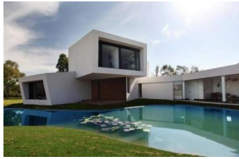
Figure 3: Haiku and Minimalism in architecture

After the crash the doll's eyes jammed open -Michael Gunton