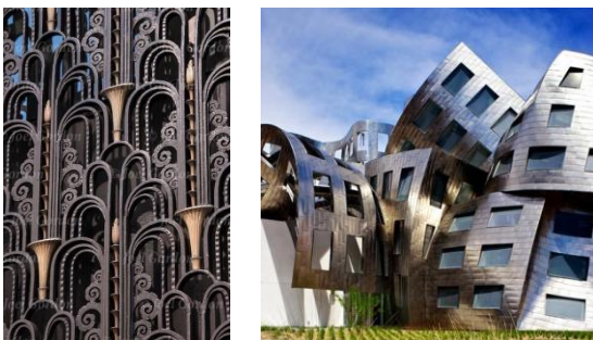
Figure 5: Art Deco and Deconstructivism

Literature reaches the society through its various forms such as poetry, novels, essays, drama etc. Every form has its own characteristics and rules. Its structure defines its identity. Similarly, architecture displays various styles. By the characteristics and rules, style is recognized.