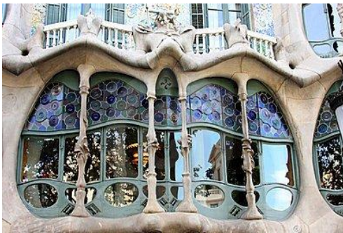
Figure 4: Sonnet and Art Nouveau architecture

SONNET XVIII Shall I compare thee to a summer's day? Thou art more lovely and more temperate: Rough winds do shake the darling buds of May, And summer's lease hath all too short a date: Sometime too hot the eye of heaven shines, And often is his gold complexion dimm'd; And every fair from fair sometime declines, By chance or nature's changing course untrimm'd; But thy eternal summer shall not fade Nor lose possession of that fair thou ow'st; Nor shall Death brag thou wander'st in his shade, When in eternal lines to time thou grow'st: So long as men can breathe or eyes can see, So long lives this and this gives life to thee.