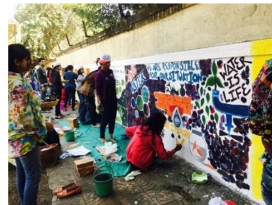
Image 2: Showing participants painting on Save Water theme.