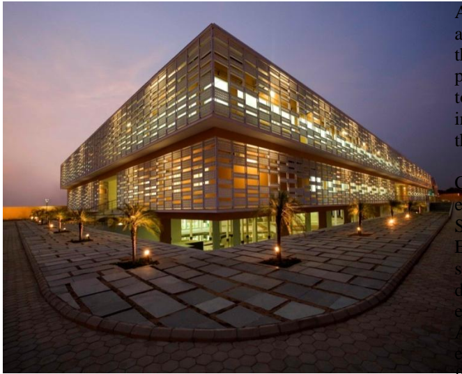
Figure 4: Facade: Pearl Academy of Fashion in Jaipur.