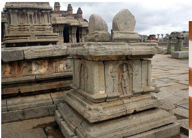
Figure 1: Tulsi katta at Vijay Vittala, Hampi, Karnataka.

These religious feelings of the Hindus reflect in their architectural designs. For instance, a “Tulsi Katta” a holy pot for Basil plant is the tradition of every Indian house since centuries ago. Basil plant possesses many medicinal properties and is worshiped every day and hence is believed to bring in good health.